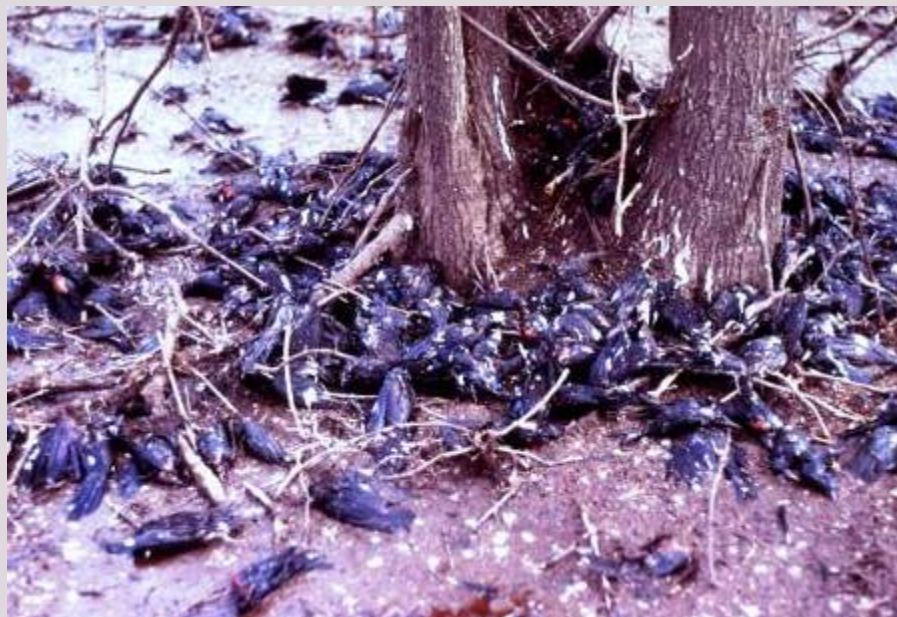
Piggott Roost, AR