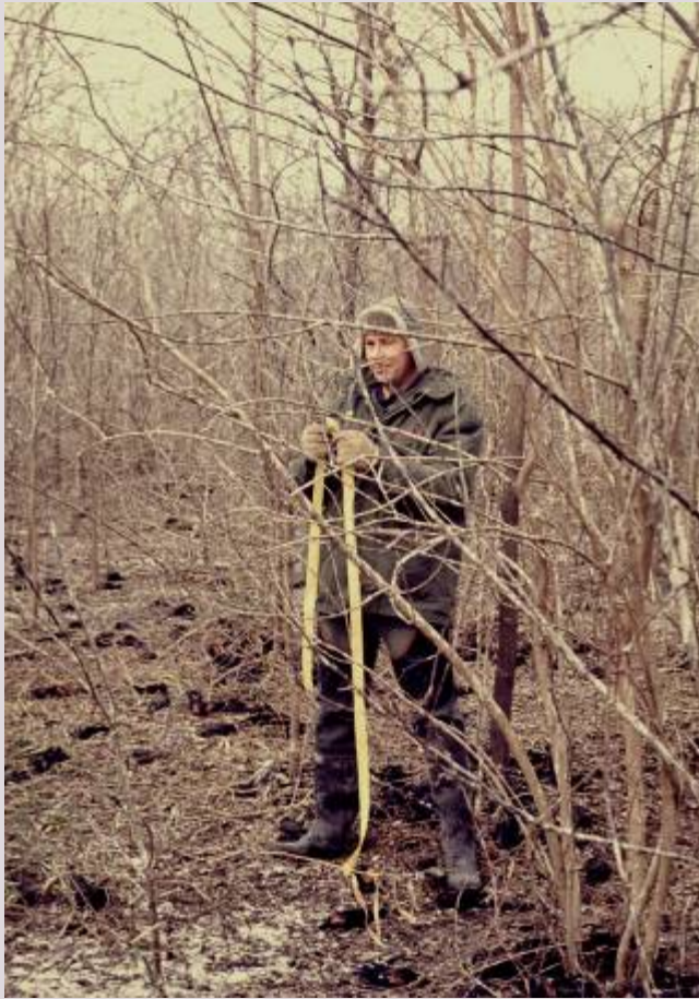
Hicks Station, AR